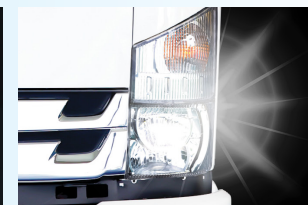
LED Headlight to provide better visibility