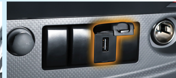
Brand New Feature - USB Charging Port