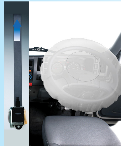
*SRS airbag system and seat belt with pretensioner are activated in the event of a frontal collision, mitigating impact to the head and chest.